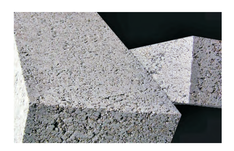
Blocks manufactured to BS EN 771 - 3: 2003